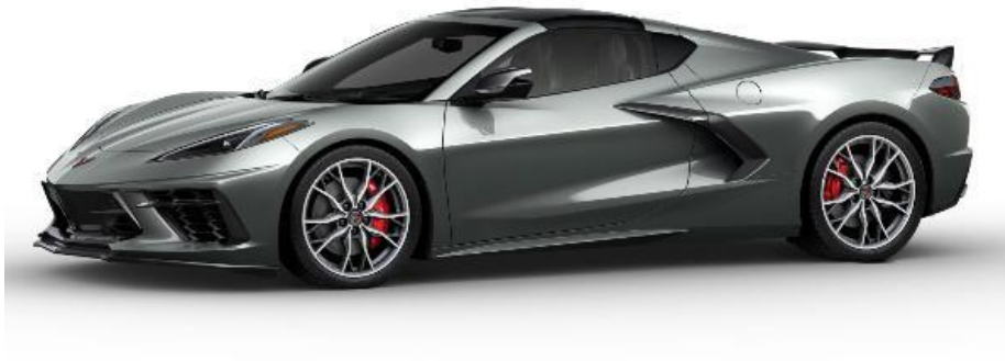
2023 Hypersonic Gray Corvette Coupe Price: $150.00 Drawing: February 9, 2023