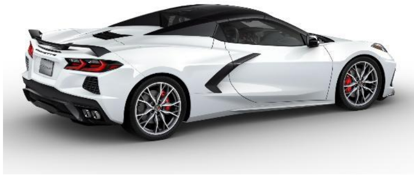
2023 Arctic White Corvette Convertible 3/9/2023 Price: $200.00 Drawing: March 9, 2023