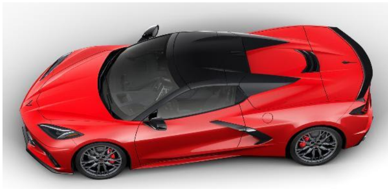
2023 Torch Red Corvette Convertible Price $20 Drawing April 29, 2023