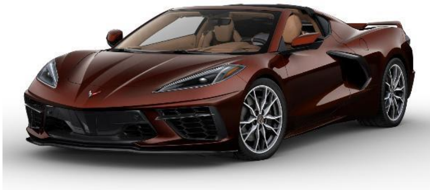
2023 Build Your Own Corvette Stingray or $80,000 Price: $250 Drawing January 19, 2023