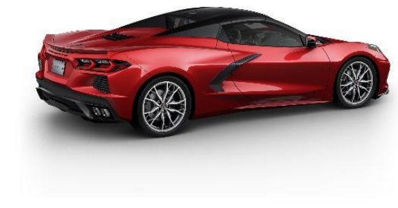
2024 Red Mist Corvette Convertible 4/27/2024 Price: $20.00 Drawing: April 27, 2024