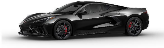
2024 Black Corvette Coupe 9/21/2023 Price: $100.00 Drawing: September 21, 2023