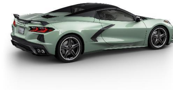
024 Build Your Own Corvette Stingray or $80,000 Price: $250.00 Drawing: October 19, 2023